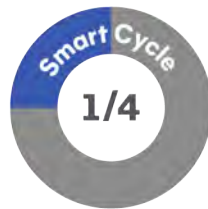
Timed Intercourse (TIC)