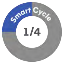
Intrauterine Insemination (IUI)