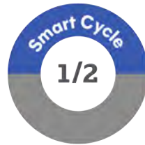
Frozen Oocyte Transfer (FOT)