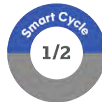
IVF Live Donor Freeze-All Donor services and creation of embryos not including frozen embryo transfer