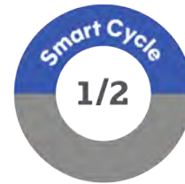
Pre-Transfer Embryology Services