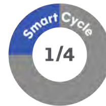
Split Cycle (Egg & Embryo Freezing) When paired with IVF cycle