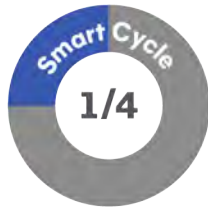
Frozen Embryo Transfer (FET)