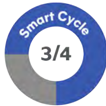
IVF Freeze-All Cycle