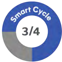
IVF Fresh Cycle

Visit the Explanation of Covered Treatments & Services section of the Member Guide to learn more. For a full explanation of what's covered under each Smart Cycle, visit the Included in Your Coverage section.