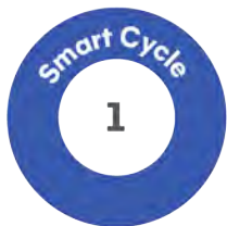
IVF Live Donor Fresh Donor services and creation of embryos including transfer to member